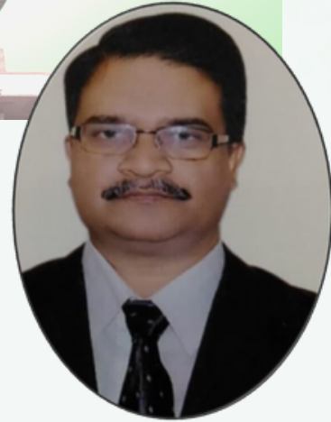
Hon'ble Shri. Justice R. M. Borde Former Judge, High Court of Bombay

Date of Inaugural Function: 14th March 2023