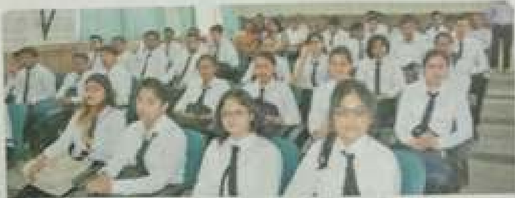
विद्यार्थ्यांनी सहभाग घेतला, यावेळी विद्यार्थ्यांना कॉलेजच्या सुविधा, संशोधन केंद्रांचे परिचय देण्यात आला.

हे विद्यार्थ्यांमध्ये प्रवेशाची प्रक्रिया सुलभतेने चालू आहे. विद्यार्थ्यांनी यावेळी कॉलेजच्या सुविधा, संशोधन केंद्रांचे परिचय घेतला. यावेळी विद्यार्थ्यांना कॉलेजच्या सुविधा, संशोधन केंद्रांचे परिचय देण्यात आला. यावेळी विद्यार्थ्यांना कॉलेजच्या सुविधा, संशोधन केंद्रांचे परिचय देण्यात आला.