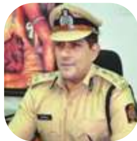
Shri Yashasvi Yadav Commissioner of Police, Aurangabad