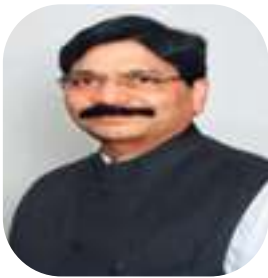
Shri Ravindra Waikar State Minister for Higher and Technical Education