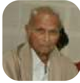
Hon'ble Mr. Justice B.N. Deshmukh Judge (Retd.) High Court of Bombay Bench at Aurangabad