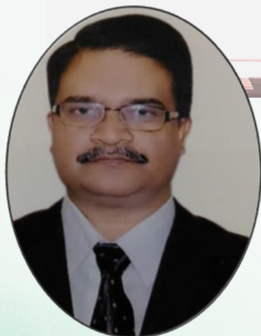
Hon'ble Shri. Justice R. M. Borde Former Judge, High Court of Bombay