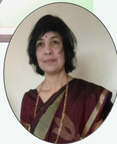
Hon'ble Dr. Justice Shalini Phansalkar Joshi Former Judge, High Court of Bombay

Date of Inaugural Function: 14th March 2023