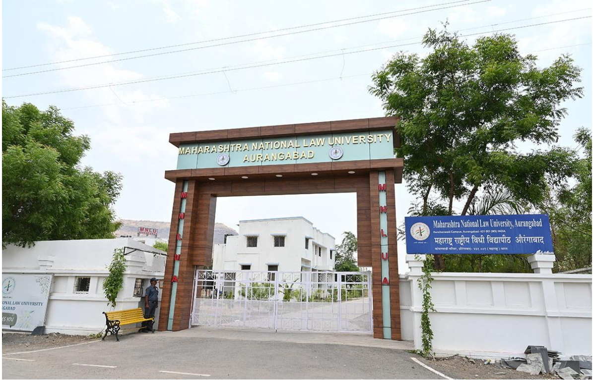
The main Gate of the Maharashtra National Law University Aurangabad Campus