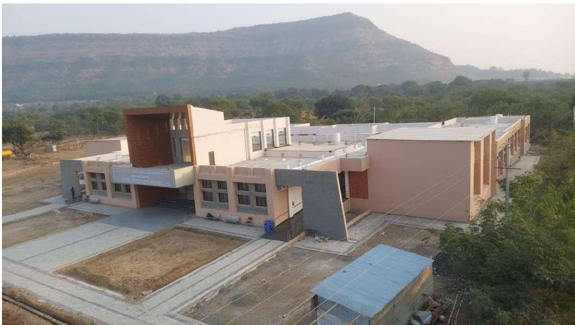
"Centre of Excellence" Building of the University