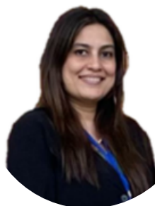
Adv. Tejal Vakil Advocate, Aurangabad Bench, High Court of Bombay