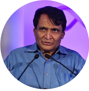
Mr. Suresh Prabhu Former G7 Sherpa, Member of Parliament, and Chancellor Rishikood University