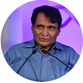
Mr. Suresh Prabhu Former G7 Sherpa, Member of Parliament, and Chancellor Rishihood University

Faculty members at MNLUA are equipped with distinguished Professors of national repute with a blend of highly qualified and young scholars who teach and research across multiple subject areas in the law, social sciences, humanities and Public Policy.